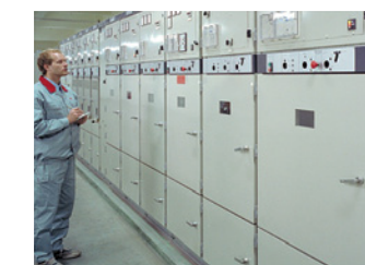
Motor control centers – Arc resistant, NEMA or IEC