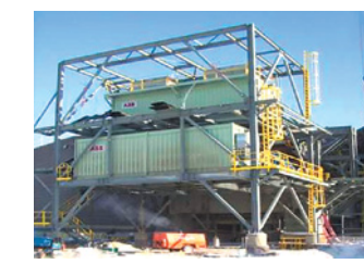
Electrification of crushing plants at the Canadian oil sands project