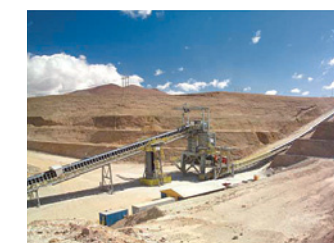
Material handling systems – several projects in North & South America