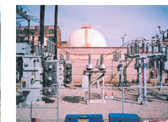
High voltage turnkey sub stations throughout Canada and USA