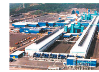
Main power supply and rectifier at a Canadian smelter