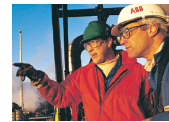
Multiple site locations in North America, offering: - 24hrs support line - 24hrs parts line - reliability consulting - remote access & diagnostic