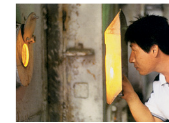
Process optimization and management