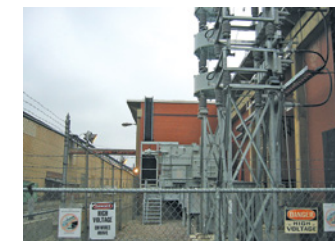
Northern Ontario electro-winning plant 110Vdc at 44,000 Amps, 0.99 PF