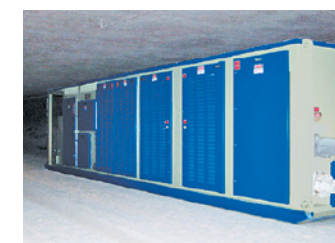
Statcom in an underground potash mine in Canada