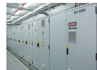
Drive and control systems for open pit mining equipment