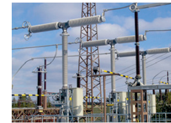
Power circuit breakers, relays, disconnect switches