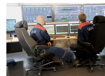
Processing plant automation and central control