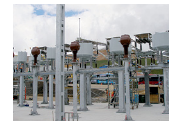
Static VAR compensation and harmonic filters