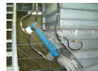
Ore pocket weighing systems