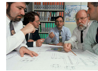
Team of more than 15 project managers devoted exclusively to large mining projects in North America