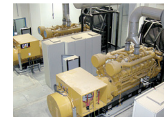
Emergency power generation and UPS