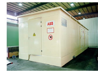
Explosion proof equipment