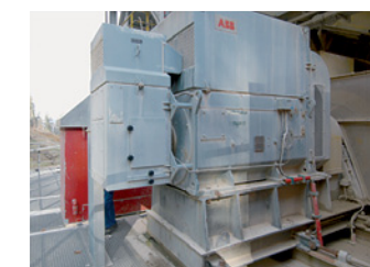
AC/DC drives, drives systems and motors