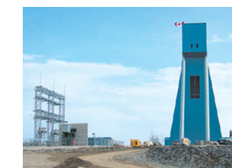
Total mine electrification and automation, including ventilation on demand. "The Mine of the Future" Reference: northern Ontario