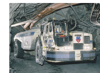
Underground electric haulage trucks available per unit or as a complete solution. NA references in northern Ontario and USA.