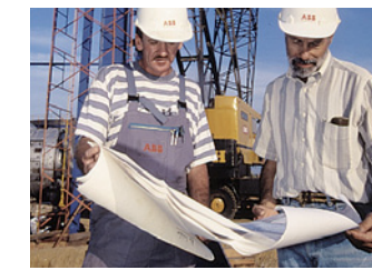
Infrastructure: grounding, lightning protection, lighting, cabling, communication systems, fire protection