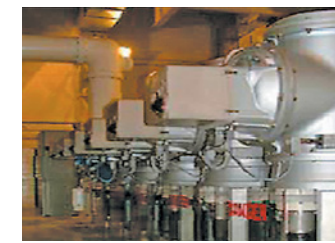
Gas insulated switchgear and industrial substations in an aluminum plant in Canada. Several references in America