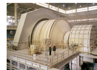
Gearless mill drives – multiple sites globally including Canada and USA