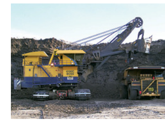
Automation and drives for draglines and shovels at the Canadian Oil Sands and in Mexico