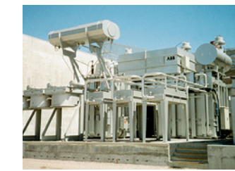
Transformers, rectifiers, switchgear and power factor correction