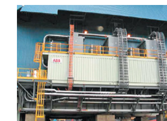
One of many turnkey surge plants delivered to the Canadian oil sands

ABB is well positioned to help you achieve industrial efficiency and environmental compliance with products, systems and services that ensures product quality, minimizes environmental impact and reduces production costs.