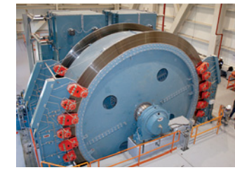
Hoist haulage system in Saskatchewan. Over 150 references in Canada and USA, 650 worldwide