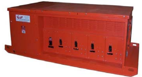
PORTABLE MINE POWER CENTERS AND SWITCHGEAR