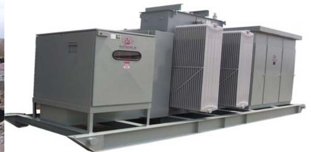
SKID MOUNTED SUBSTATIONS