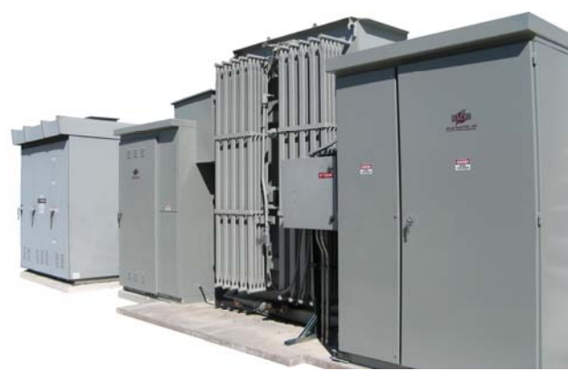
INDOOR AND OUTDOOR MEDIUM VOLTAGE SWITCHGEAR