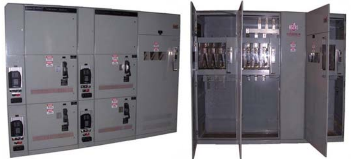
Farallon Minera Mexicana-Mexico

CH DS-II 4000A Power Distribution Centers w/ 4000A Main Breakers