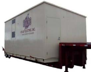
Farallon Minera Mexicana-Mexico

15kV Outdoor Westinghouse VCP-W Switchgear