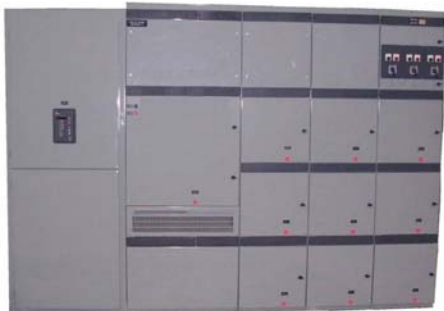
Ipsco Koppel Tubulars-Baytown –TEXAS

AB 2400V 600HP Autotransformer Type Reduced Voltage Starter