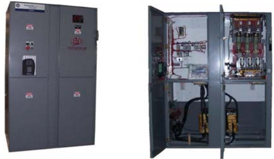
Vena Peru S.A.C.-Peru

500KVA Underground Mine Power Center 13,800-480Y/277Volt