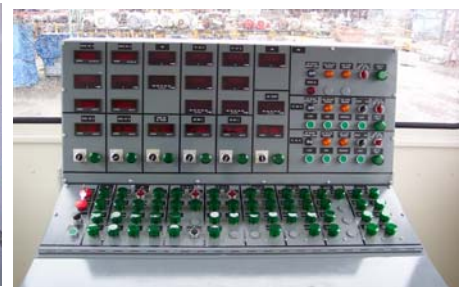
CUSTOM CONTROL VANS